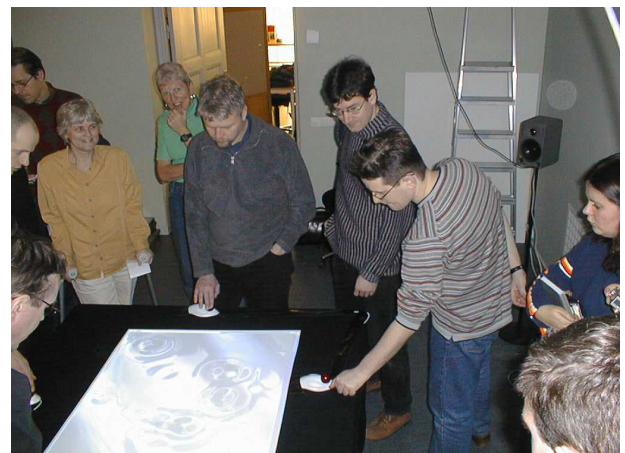
Figure 3. Publicly exhibiting ToneTable.

The sonification of activity at the table was also well received and clearly several participants took some delight in making loud noises with vigorous trackball movements. The fact that a sound could be heard in an immediately responsive way to one’s individual activity through the presence of a tone emanating from under the table gave a clear indication that one was having an effect. The synthesised splashing sound was also appreciated. Good feedback was received about the high quality of the computer graphics and the sound, a quality far exceeding that ever experienced before in a computer-related installation by some of the attendees. Our public demonstration raised a number of interesting critical points and these are worth discussion.