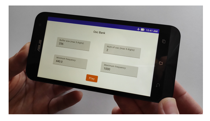
Figure 2: Phone running the oscillator bank Android audio app.

simple application following the latest Android app architecture guidelines<sup>10</sup>, comprising a minimalistic UI and a small audio engine. The audio engine runs the oscillator bank and sends samples to the phone's audio device, while the UI is used to pass initialization parameters to the oscillator bank, select the audio buffer size and start/stop the audio stream (Figure 2). This app was inspired by the tutorial on wavetable synthesizer by Jan Wilczek<sup>11</sup>. As discussed in Section 2.2, Android app development involves a combination of different programming languages. We built the UI in Kotlin, utilizing the Jetpack Compose framework, which has become a standard for modern Android UI development. For optimal performance, we implemented the audio engine in C++ and used the Oboe audio library, which serves as a wrapper for both the modern AAudio library and the legacy OpenSLES library. Oboe is designed to ensure high performance and provide backward compatibility with older phones and Android versions, which is relevant to our project's aim.